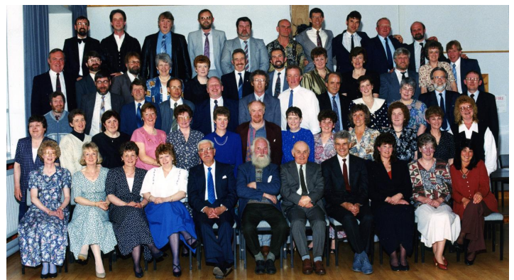
'Class of 1960' at their 1994 reunion

The Shetland Hamefarin Committee wishes the Class of 1960 all the best for their upcoming reunion.