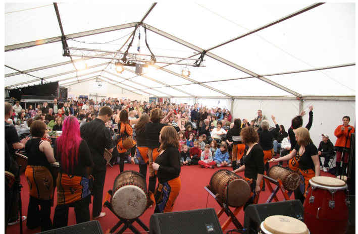
A packed entertainment tent at Flavour of Shetland