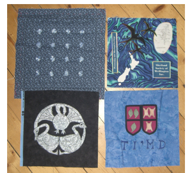
Contributions from all over the world for the Hamefarin Quilt