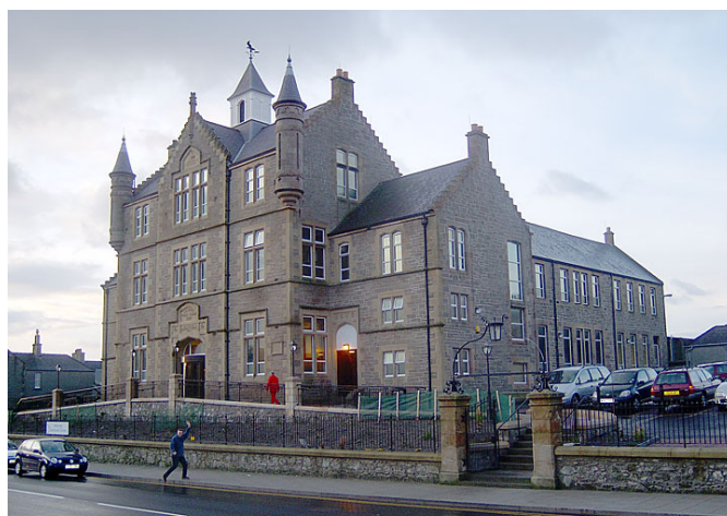
Islesburgh Community Centre, King Harald Street, Lerwick

Knitters and spinners will hold daily sessions from Tuesday – Friday, showing the skills which has made Shetland knitwear world famous – a place to watch, and maybe learn to knit the