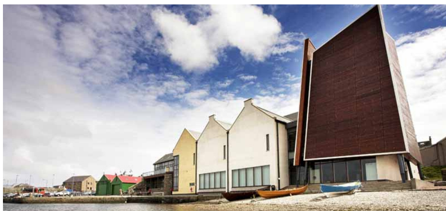
The Shetland Museum and Archives building at Hay's Dock, Lerwick

One of the main venues for activities during the Shetland Hamefarin 2010 will be the Shetland Museum and Archives, located on the historic Hay's Dock in Lerwick.