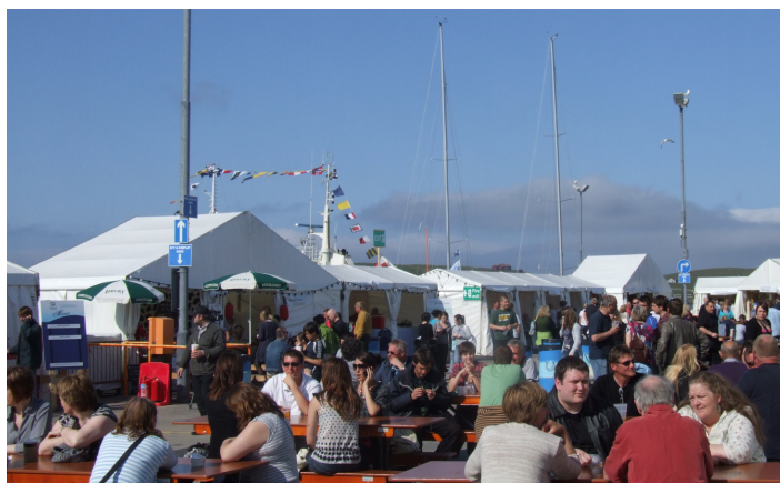
The crowd enjoys the weather at Flavour of Shetland