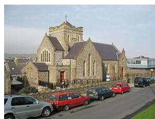
The Shetland Library

For more information visit www.shetland-library.gov.uk .