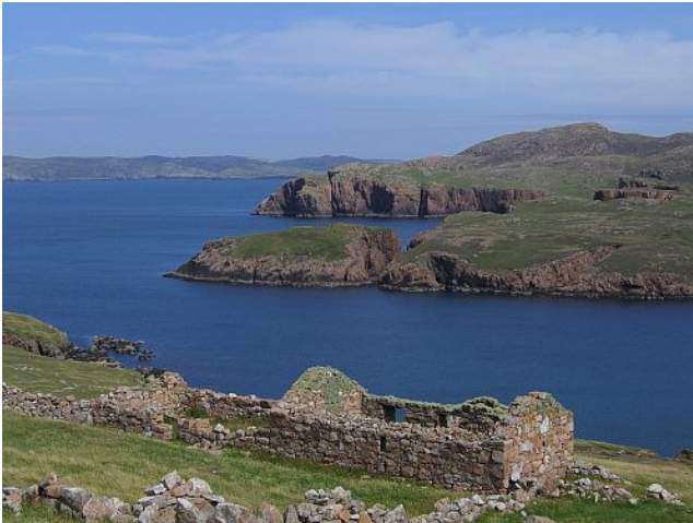
The deserted croft of Burg, Muckle Roe built from blocks of 400 million year old red granite seen in the cliffs opposite.

The ‘Auld Rock’ is the affectionate, but very appropriate, appellation exiles have for Shetland. Intending Hamefarers will know something of Shetland’s cultural, historical and archaeological heritage but how many realise that all of this is due to Shetland’s three billion-year-old Earth heritage.