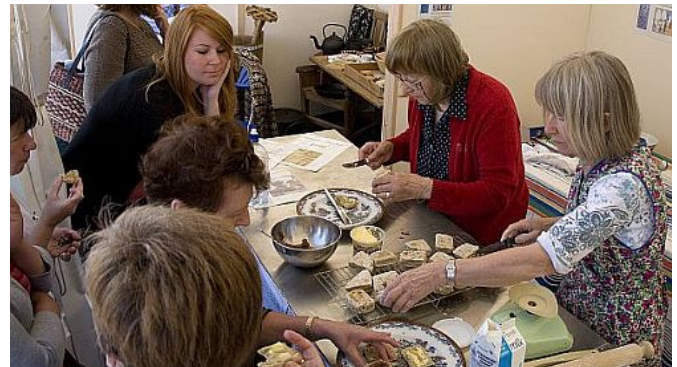
Bannock-Making Demonstrations—a highlight at last year's Flavour of Shetland event