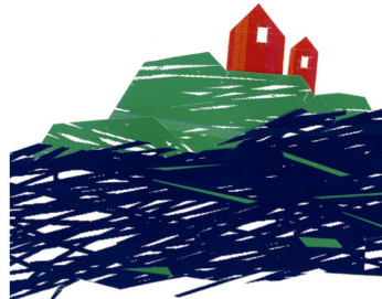
Power of Place Shetland's Year of Architecture and Place 2010

The project will also establish a sustainable