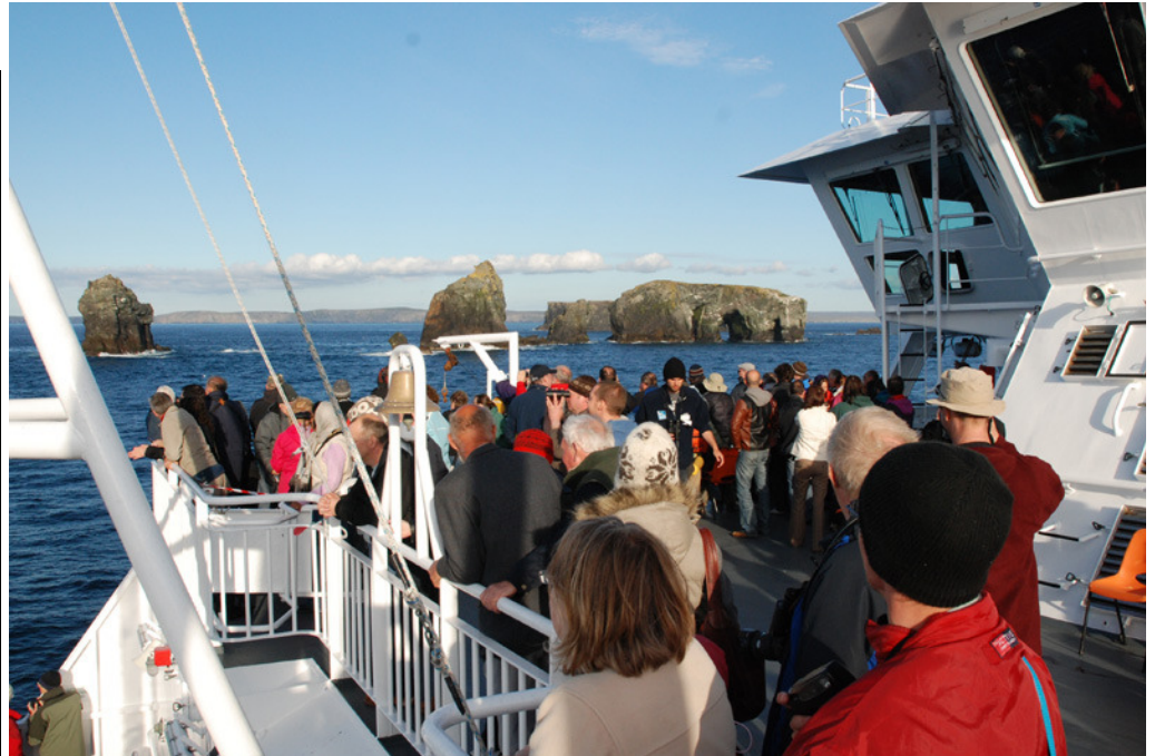
Passengers on last year's Simmer Dim cruise enjoy a glorious view of the Ramna Stacks from the deck of the Daggri