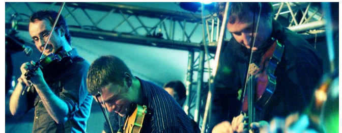
Fiddlers' Bid—set to perform at the Final Fling

South of the Border—19th century migration to England and Wales—Shetland Museum and Archives